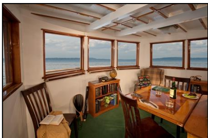
The Observation Lounge

Pilot house visits are welcome; with comfortable bench seating located behind the steering station.